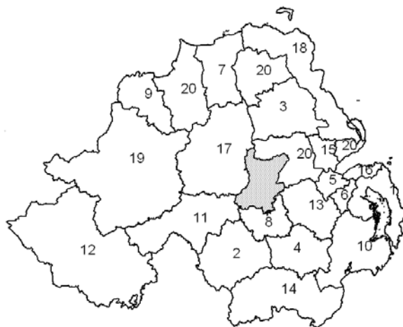
Figure A4.1: Northern Ireland by LGD

Councils which have been combined have been selected purely to satisfy sample requirements, and not on a geographical basis.